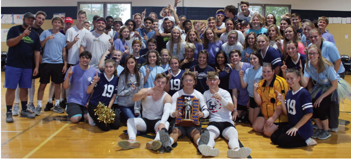
Congratulations to the Class of 2019 for being the Homecoming challenge winners!

Homecoming 2018 ended with a student dance which took place in the Ralph Boyer Gymnasium. Students danced the night away at this New Year's-themed event. Thank you to everyone for "coming home" and making homecoming week an amazing celebration of the Lancer family.