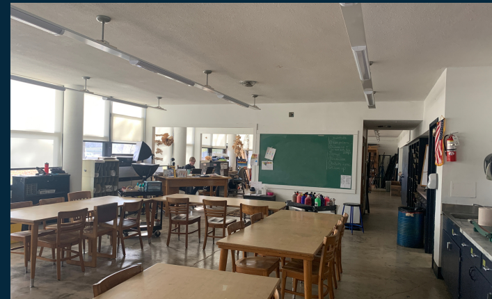
Art room remodel