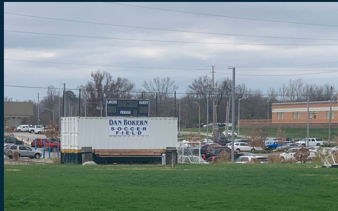
Soccer watering system, grass, pressbox and scoreboard