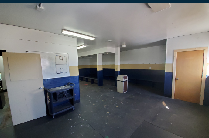
Visiting locker room