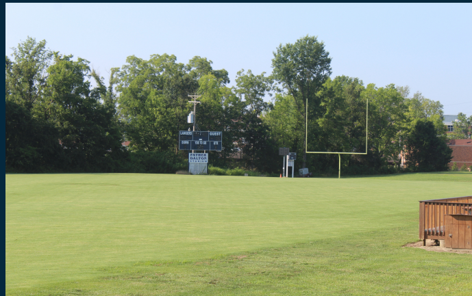
Stadium grass, fence and time clocks