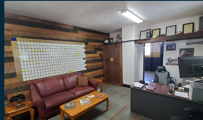
Athletic Director's office