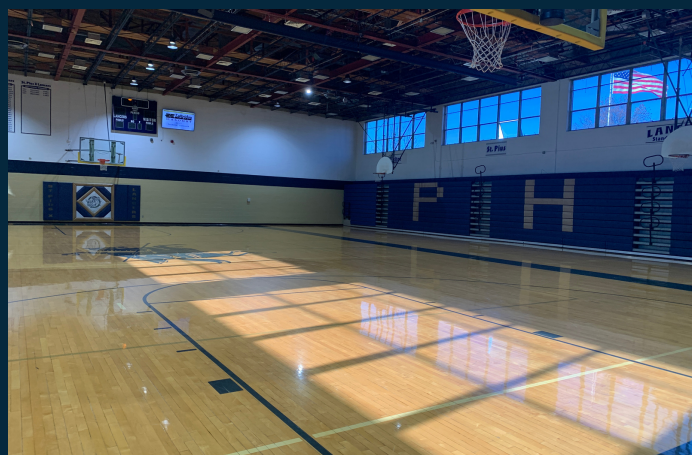
Gymnasium window tint, new paint, TV and HVAC