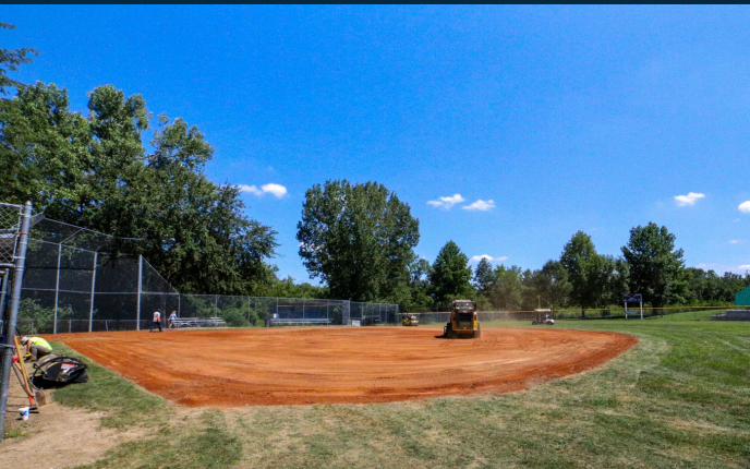
Softball field dirt and scoreboard