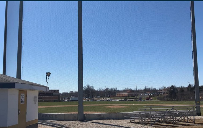
Baseball backstop, fencing and grass

'Change is the only constant' is certainly a phrase applicable to 2020. So too can it be used in reference to our campus, where improvements large and small are always taking place. Many of those improvements are showcased here. While the most visible change is the Wellness Center, which opened this spring, equally important upgrades are taking place all over St. Pius X. This summer saw a new high-efficiency HVAC system installed in the gymnasium, while security was upgraded with a new security camera system and adding keyless entry options to several campus entrances. Classroom improvements included an overhaul of the Art classroom, and the kitchen received a welcome update with the new walk-in freezer, replacing the original which had been installed in 1959.