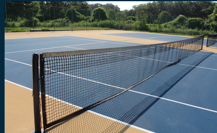
Tennis resurfacing, paint and nets