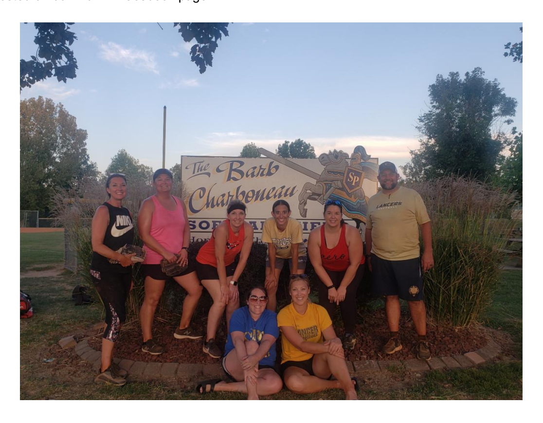
Alumni Volleyball Game

The alumni softball game was held in September on the Barb Charboneau Softball Field. The girls that attended had a lot of fun and laughs. Please consider joining us next year. Details will be posted on our Alumni Facebook page.