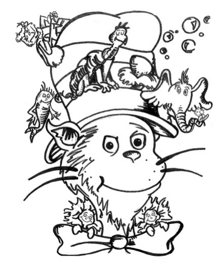
Artwork courtesy of our very own, Kacey Flanagan, Class of 2020